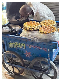
Street Vendor Old Delhi